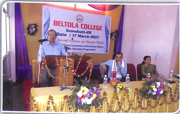
Seminar on Human Rights