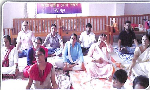
International Yoga Day Celebration