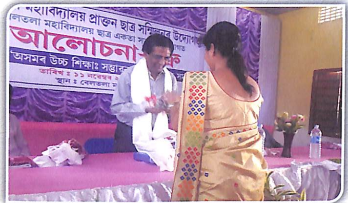
Seminar organised by Alumni