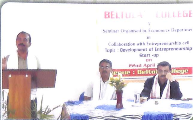
Seminar organised by Entrepreneurship cell and Department of Economics