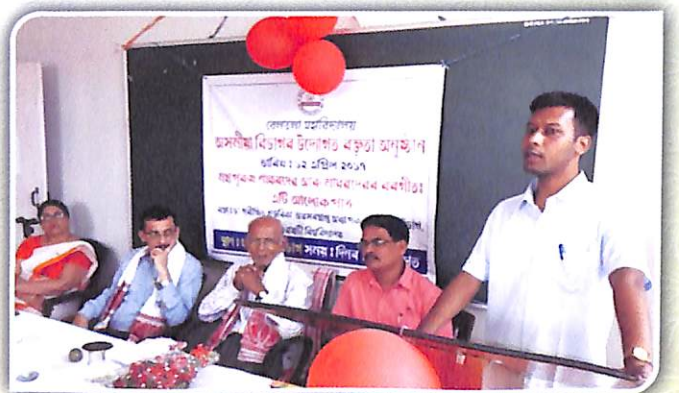
A talk in the Department of Assamese