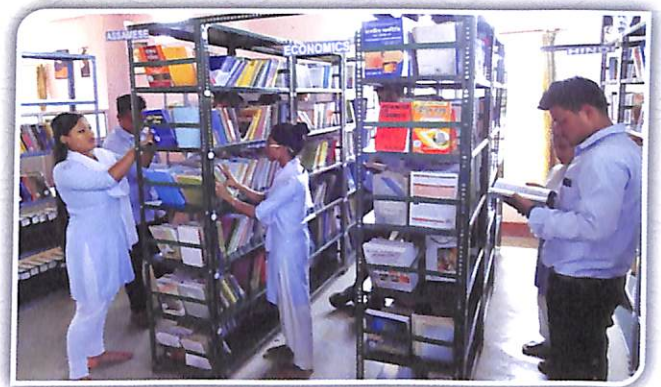
Students in the Library