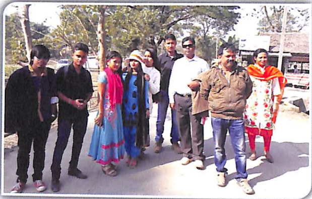
Picnic to Pobitora