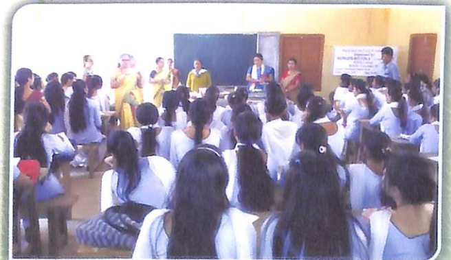
Workshop on Food Processing