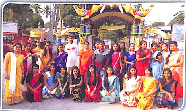
Field Trip to Bordowa