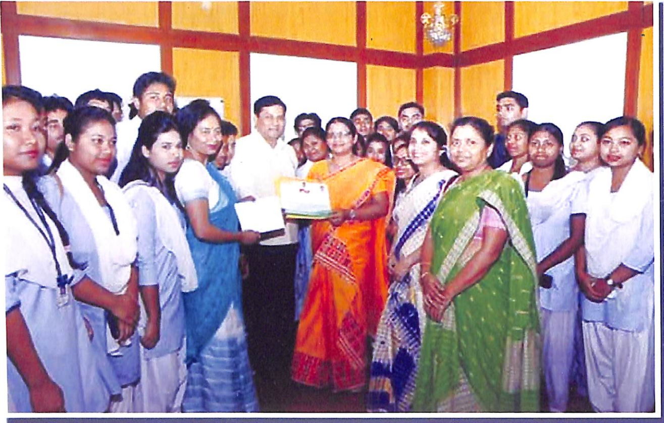
The Students & Faculty Members with Hon'ble CM of Assam Sarbananda Sonowal at Assam Legislative Assembly Hall