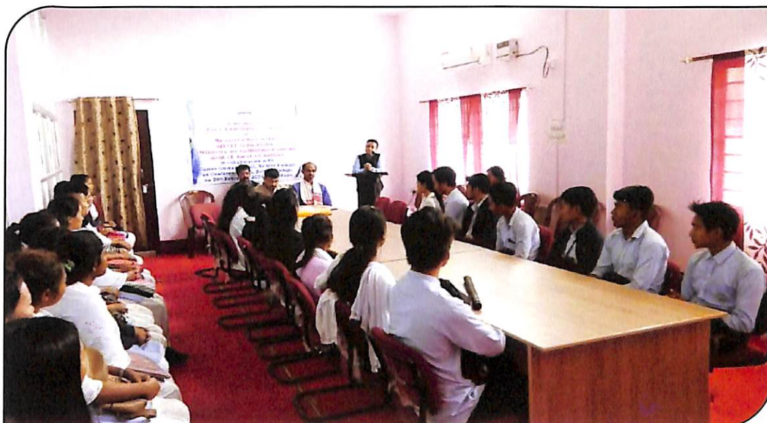
A demo on Computer Course, an activity of Career Guidance Cell

arranging training programme for computer literacy for the students and staff of the college, collecting feedback system and take necessary steps.