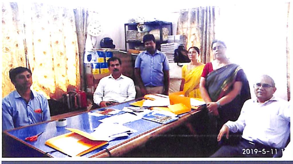
Deputy Controller of Examinations & his team from Gauhati University visited the College on 11 th May 2019