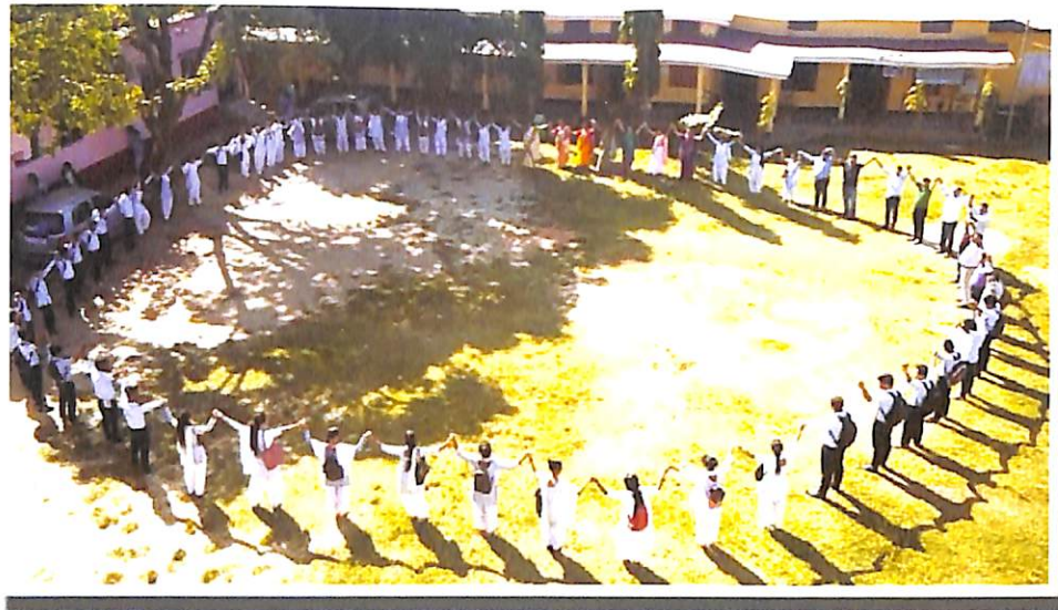
Human Chain (a Symbol of Unity) by the College Students & Faculty Members