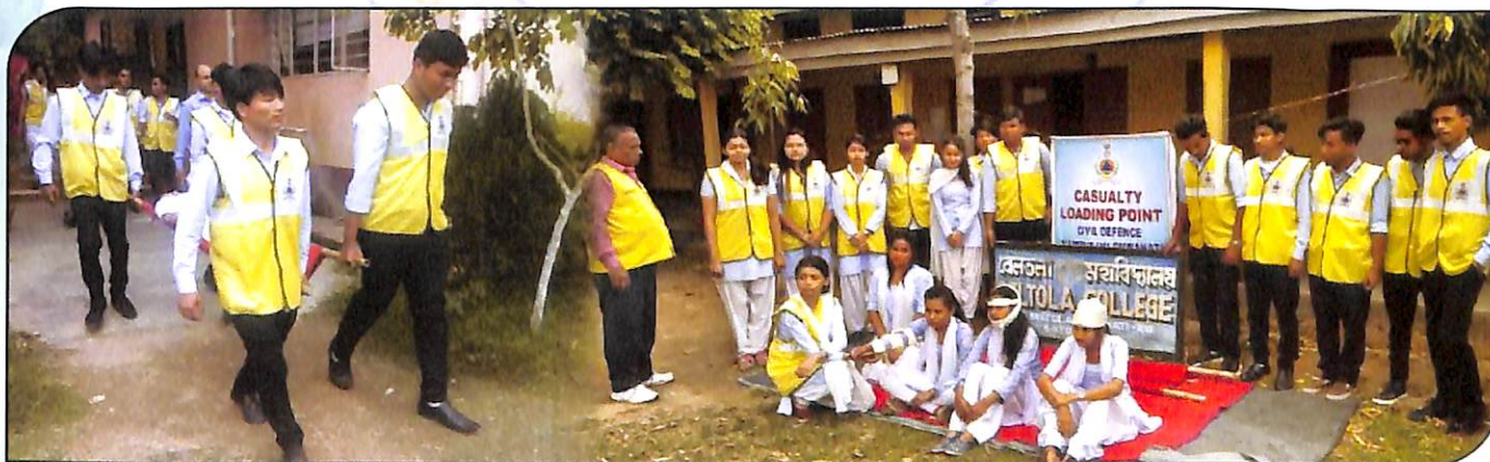
College Students are Participating in the Mock Drill Programme held at College Campus