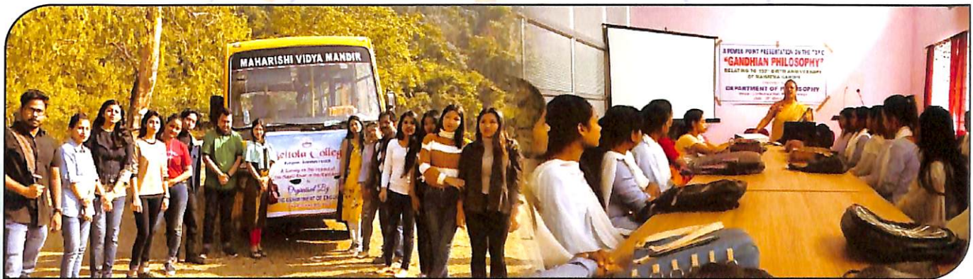
Field Trip organized by the Department of English, Seminar on Gandhian Philosophy organized by the Department of Philosophy