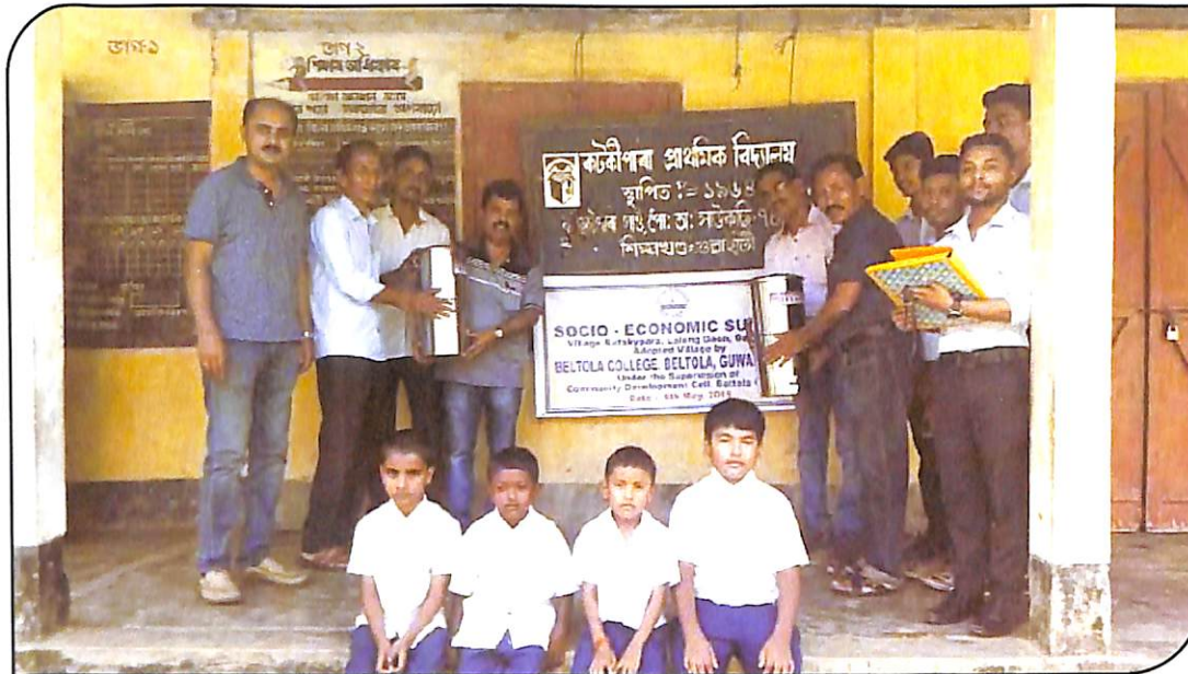
Community Development Cell organized a Socio- Economic Survey at the adopted village of College Katakypara and donated water purifier for benefit of LP School students