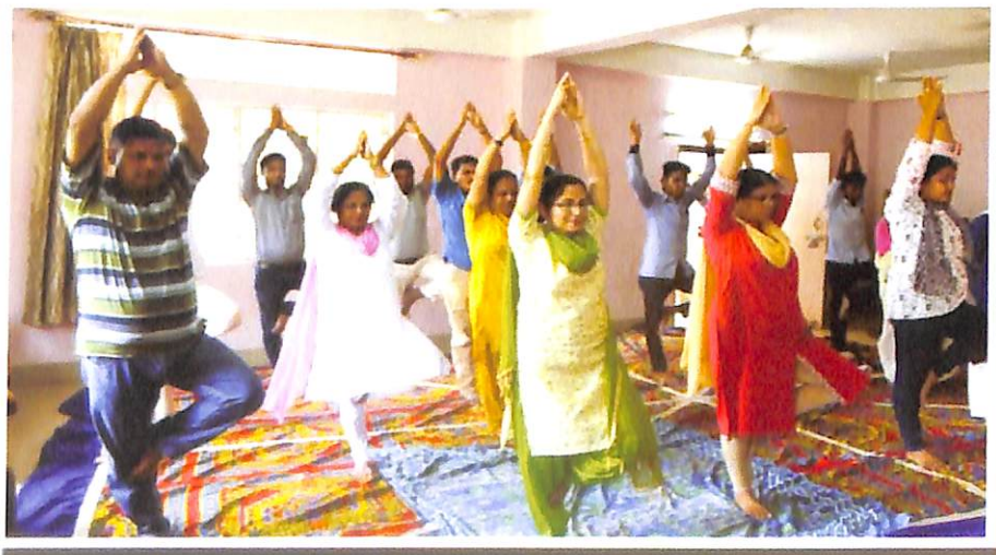
Observation of Yoga Day at College