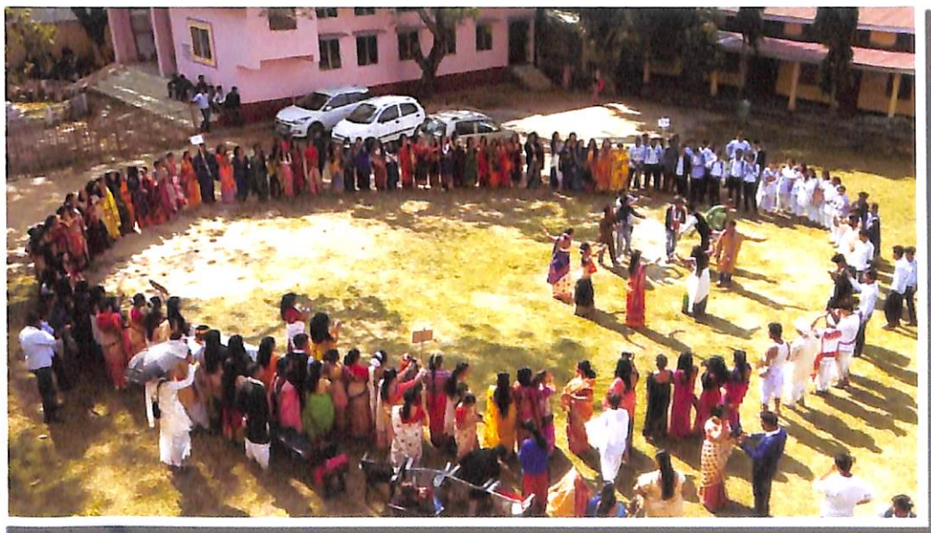
Cultural Programme held at the College Week Festival 2019