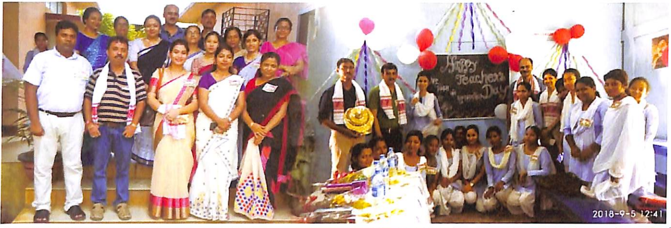
On the occasion of Teachers' Day Celebration 2018