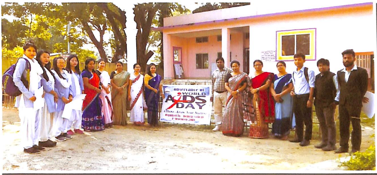
Observation of World AIDS Day at College