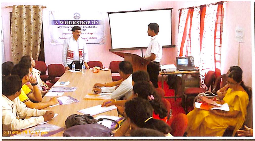
Workshop on Accounting and Financial Management held at College