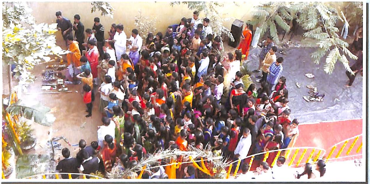
Students are present on the occasion of 'Nirmali' on Sarawati Puja