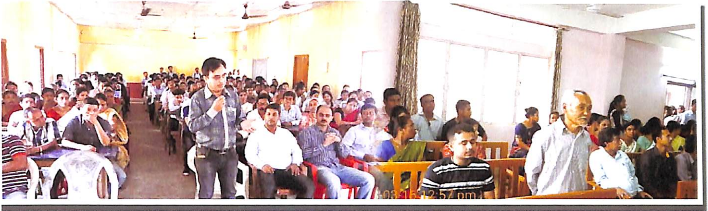
Guardians' Meet held at College