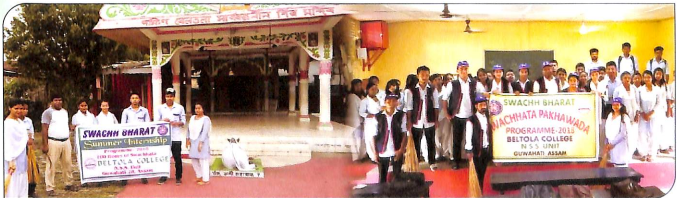
Students are participating on Swachh Bharat Programme organized by NSS Unit of the College