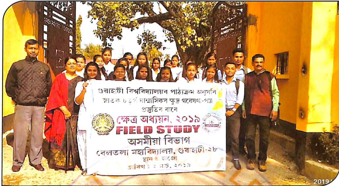
Field Study 2019 to Hajo organized by the Department of Assamese