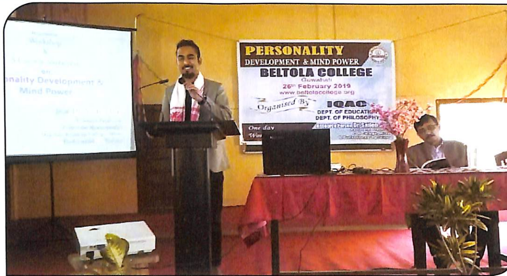
Workshop on Personality Development & Mind Power organized by the IQAC, Department of Education & Philosophy