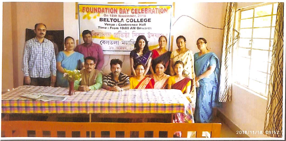
College Foundation Day Celebration on 18th November 2018