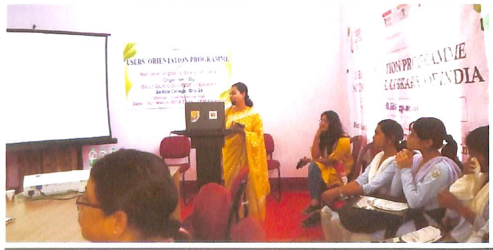
Orientation Programme on National Digital Library of India organized by the College Library