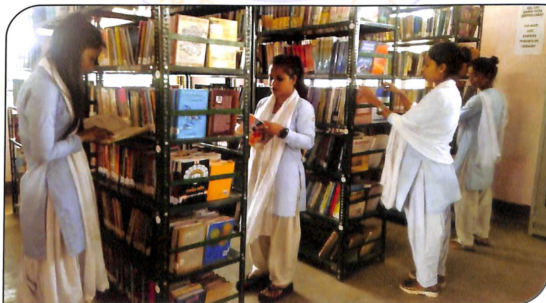
Users' Searching books in the College Library