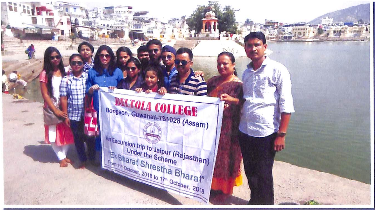
Excursion Trip to Rajasthan by the Faculty Members and Students of College