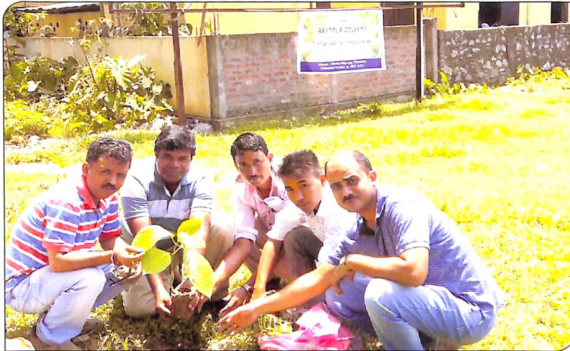
Plantation Programme at the College Campus on World Environment Day