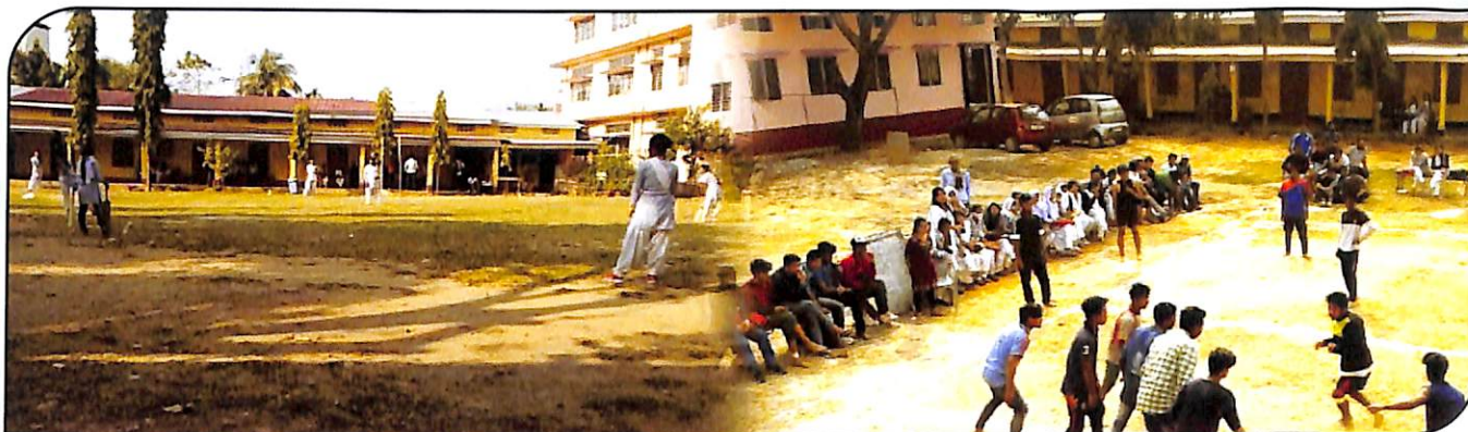
College Girls & Boys are participating in the College Week 2019