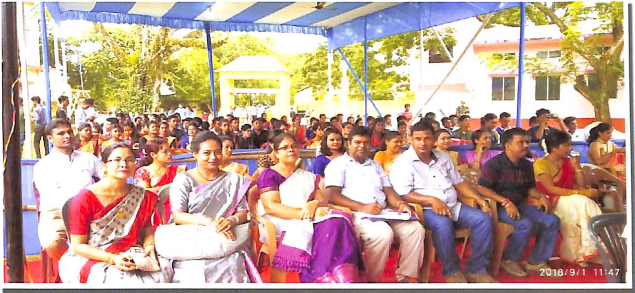
Faculty Members & Students are presence in the eve of College Freshman Social 2018