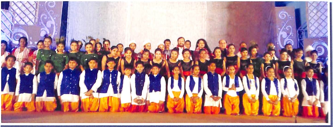
The College Students with Hon'ble Union Minister Prakash Javadekar at Brahmaputra Literary Festival