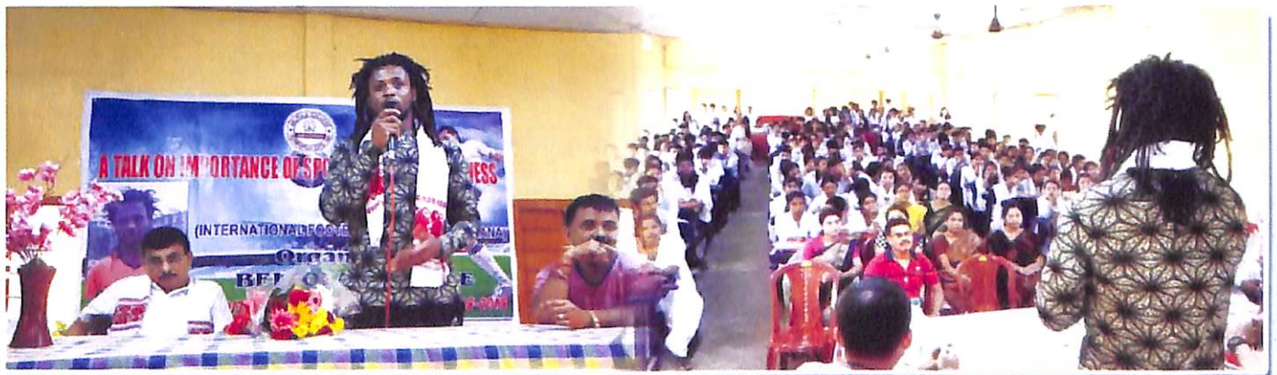
International Football Player from Ghana motivating the College Students in a talk on Importance of Sports & Fitness